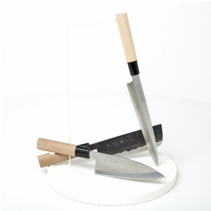
Photo: Set of Japanese kitchen knives showing a 'Deba bōchō' in the foreground, used to chop fish or meat, a square-bladed 'Nakiri bōchō' for vegetables and a 'Yanagi-ba-bōchō' used to make sashimis.

In certain cases, preparation techniques may be subject to particular rules belonging to particular cultures. An example of this would be the technique for cutting up raw fish in Japan.